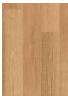
545 Apple-Box Gum