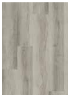
700 Platinum Grey