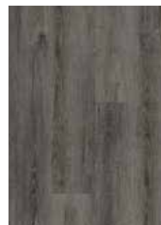
790 Silhouette Oak

While all care is taken, product images may vary in colour due to possible printing process variations. Images are to be used as a guide only to give an idea of the colour and nuances of the pattern, but are not fully representative of the variations among the planks (which reflects the natural product which inspired the design). For a representative view of the surface structure and variations within the design, take a look at the big samples on display and ask your retailer for more advice. *Subject to proper installation, maintenance and local building code/regulatory approval.