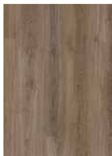
580 Fallow Oak