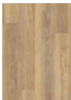
520 Brass Oak