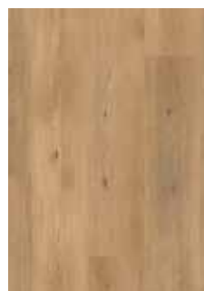
300 Sable Oak