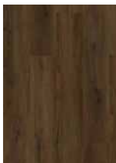
180 Burnt Umber