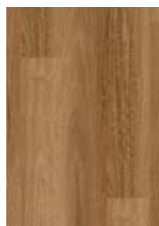
555 Marble Spotted Gum