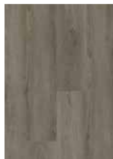
720 Pepper Oak